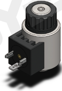
技术参数 / technical parameter